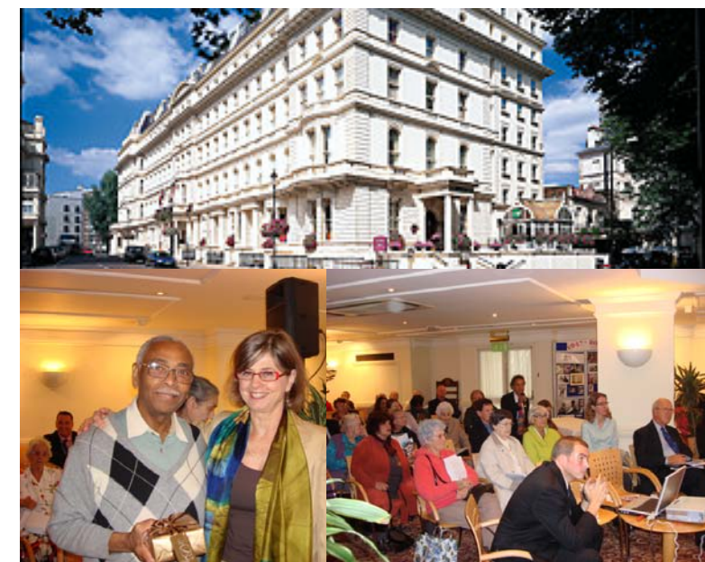
Corus Hotel Bayswater Road

Our Annual General Meeting took place on Thursday the 20th September at the Four Star Corus Hotel in Bayswater. Over 50 people enjoyed a montage of photographs from the past after an enthralling presentation on dignity and respect for older people in hospital by Dr Jackie Morris