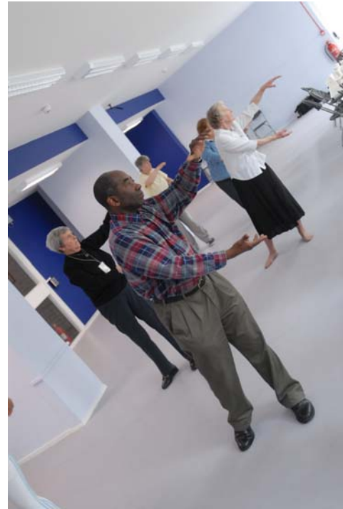
Tai Chi in action at Glastonbury