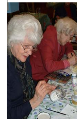
Glass painting at Covent Garden

1947 was the year that the Westminster Old Peoples Welfare Association was formed. This was the forerunner to our existing Age Concern Westminster, and how things have progressed in the intervening 60 years. To celebrate this momentous occasion Age Concern Westminster have set the task of raising £60,000 over the whole year. This money will be used for essential equipment and services to help older people, including replacing a minibus.