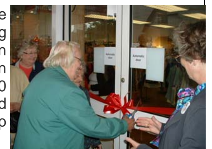
Some of the highlights from the recent past.....The opening of Edgware Rd shop

Please keep an eye out for a comprehensive list of events and please join in to make 2007 one of our best.