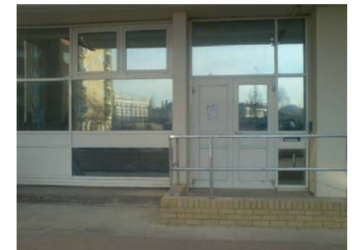
Glastonbury ActivAGE sw1